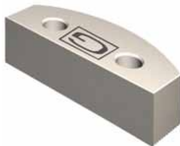
Art. 645T Soft Jaws