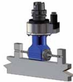
Double sided angle head 90° type DUO WZX For two milling and boring operations in opposite directions.