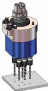
Multi spindle head MULTI To drill multiple holes at one time.