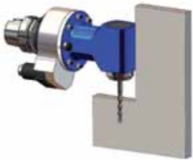
Angle head 90° type MONO WSX For single milling and boring operations without clearance issues.