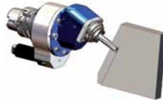
Fixed angle head type FIX WFX For milling and boring operations at a fixed angle.