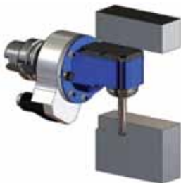
Angle head 90° offset type FORTE WWX Compared to our MONO type it has an increased usable tool length, internal coolant is an option.