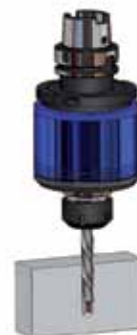
High speed spindle RAPIDO SL / SLI For boring or light duty milling applications with increased rpm.