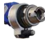
HSK DIN 69893